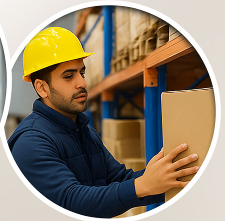
Distributors & Channel Partners